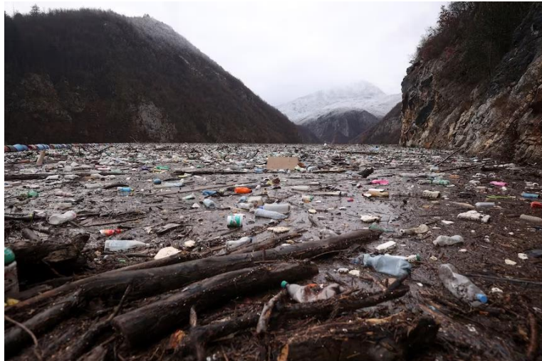
Figure 2. Tons of waste dumped in poorly regulated riverside landfills or directly into waterways, ending up accumulating behind a garbage barrier in the Drina River.

Tons of garbage and waste float along the Drina River bed all the way to the dam near Visegrad, creating a large garbage island. Natural landscapes and straits have become landfills of plastic, bags, wooden assortments, rusty barrels and bottles. Floating waste has been found in the watercourse at all levels, with the largest amount in lake reservoirs near hydroelectric power plants. Heavy and dirty waste moves to the bottom and settles there, and the waste visible is only part of the waste. In the reservoirs of hydroelectric power plants, part of the waste remains on the surface, part remains at the bottom, part goes over the spillway over the power plant and continues to move, and part is cleaned. These cycles are repeated periodically. When the waste is removed from the water, it involves its proper disposal. Natural environment of the watershed is most threatened by anthropogenic influence, where human ignorance damages the overall biodiversity and hinders sustainable development as well as touristic valorization of numerous natural and anthropogenic values. Floating surface visible waste is shown in Figure 2 is only part of the current state of the amount of waste [12].