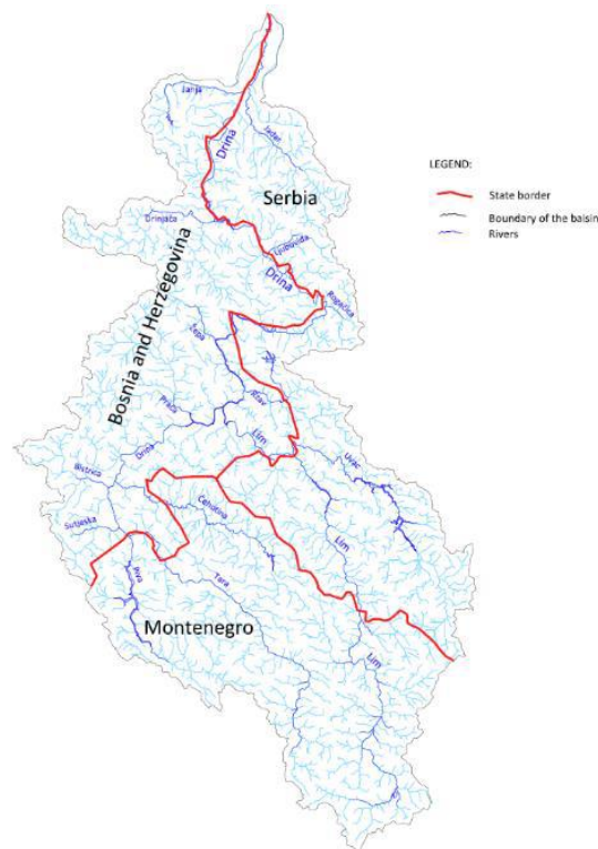
Figure 1. The hydrographic network of the Drina River Basin