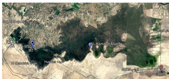
Figure 1. Al-Hammar Marsh, Iraq and the Mesopotamian Marshes with drainage features

The Al-Hammar Marsh in southern Iraq, one of the largest and most significant wetlands in Mesopotamia, is essential to the preservation of aquatic ecosystems, the administration of water resources, and the augmentation of biodiversity in the area. The principal water sources supporting the wetland include the Al-Khamisiya Agricultural Drainage; (part of the MOD), freshwater from the Euphrates River (Umm Al-Wada), and the influx of Persian Gulf water through the Aramco pipeline. The wetland is situated between the Tigris and Euphrates rivers, adjacent to the cities of Nasiriyah, Suq Al-Shuyukh, and Al-Basra.