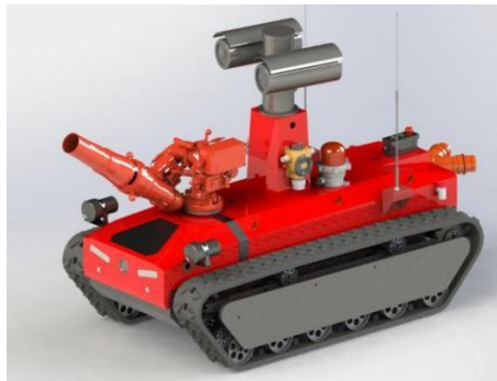
Figure 3. RXR-MC80BD-TG61 firefighting robot

China started researching fire robots in the 1970s. With the constant advancement of science, technology, and technical infrastructure, the field of fire robot research and development has now reached a new level. In the event of a fire mishap, firefighting robots must be able to accurately assess the environment, gather and analyze information and data in a secure area, and establish the location of the fire source and the cause of the fire through analysis and judgment [27]. In risky fire conditions, using firefighting robots instead of people to do rescue operations may become more prevalent, effectively lessen the challenges of rescue. Currently, firefighting robots are evolving in the direction of automation and intelligence, and China is aggressively importing cutting-edge foreign robot technology. As a result, these robots are becoming ever-more-perfected in accordance with the unique circumstances and technical level in China (Figure 3).