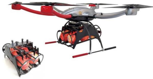
Figure 2. JTIS24F-6 firefighting drone